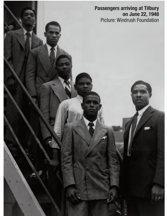
Passengers arriving at Tilbury on June 22, 1948